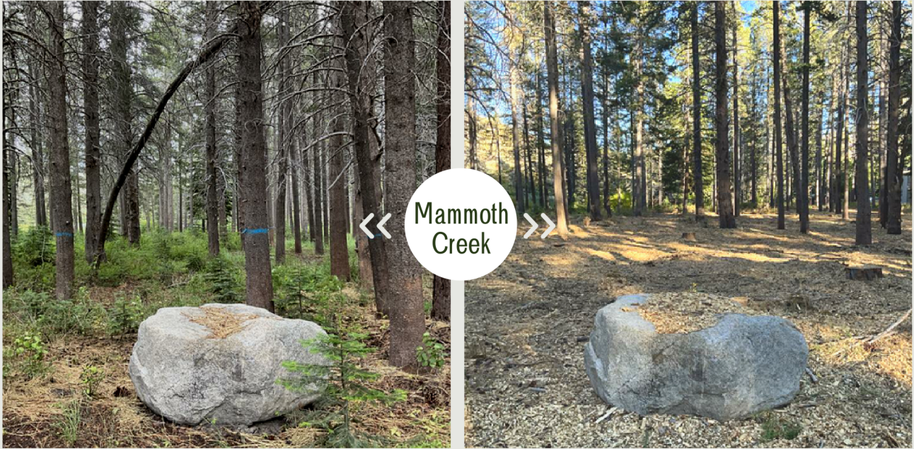
BEFORE Aug 30